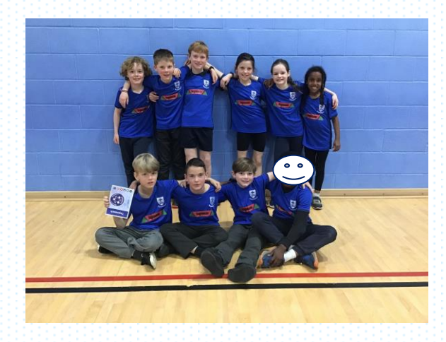
Year 3 & 4 went to St Bede's to attend a multi sports event