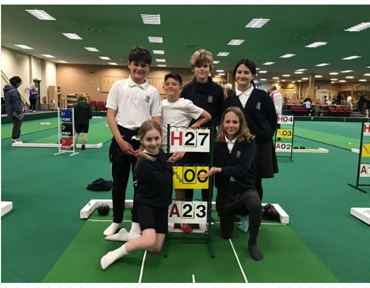
A group of year 5 & 6 children went bowling the Bristol bowling centre