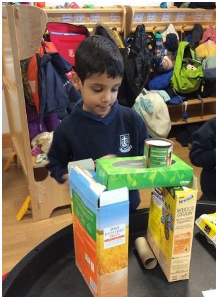
Reception child and bridge