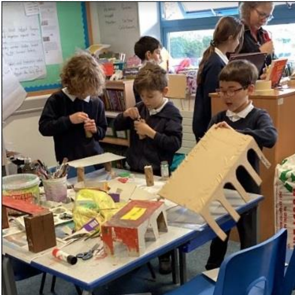
Year 4 working hard