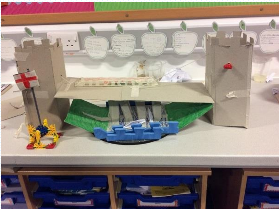
Year 5 bridge