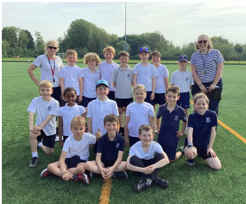
Massive well done to the year 4 cricketers who represented us at St Bede's this week at a non-competitive tournament. Their playing was superb and showed great respect and consideration for the other teams. We look forward to seeing you to play again in the future!