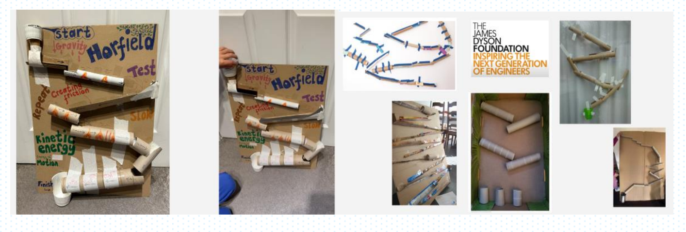
EYFS will do a slightly different challenge: Use their outdoor area and use piping / tennis balls other materials to build a large marble run.