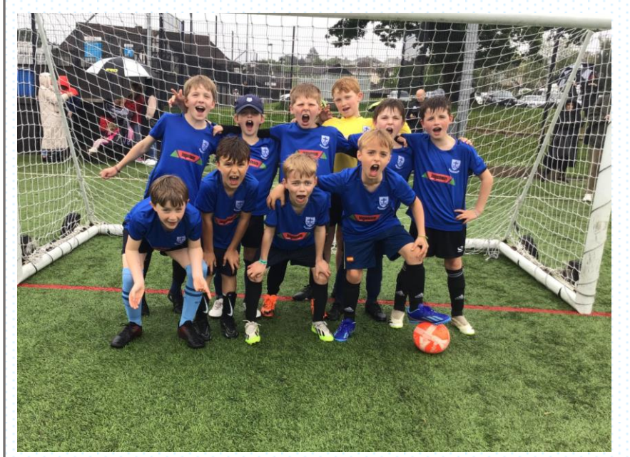
A massive well done to the boys football team for a great tournament and for being champion on the evening. They played 5 games and they won 4 and draw 1. They were unbeaten on the evening.