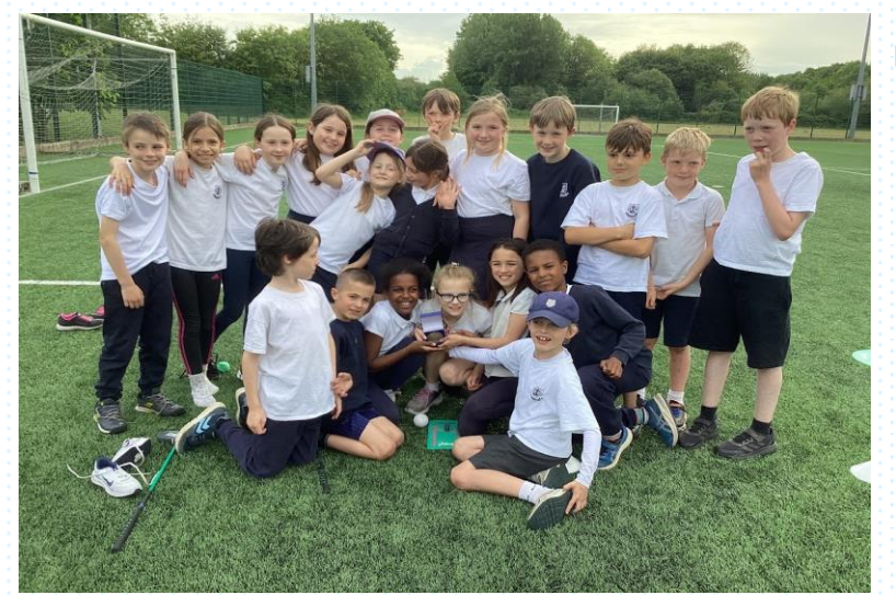
Well done to the year 4's who took part in a golf competition At St Bede's, then won a Sports Skills medal for their values, teamwork and positivity!